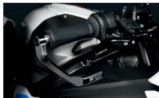
Aluminium lever guard