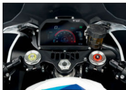
Dashboard protection / top triple clamp